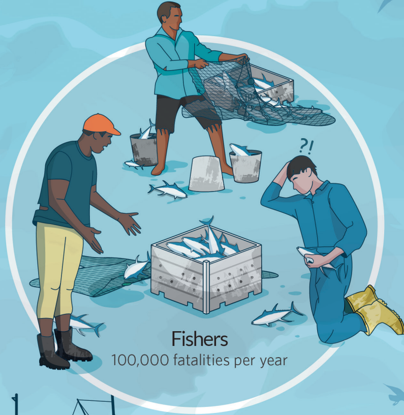
Fishers 100,000 fatalities per year